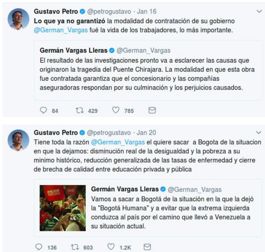
Figure 2. Some of the messages exchanged by @petrogustavo and @German_Vargas during January 2018.

Petro does not let pass the chance to engage with Vargas Lleras.