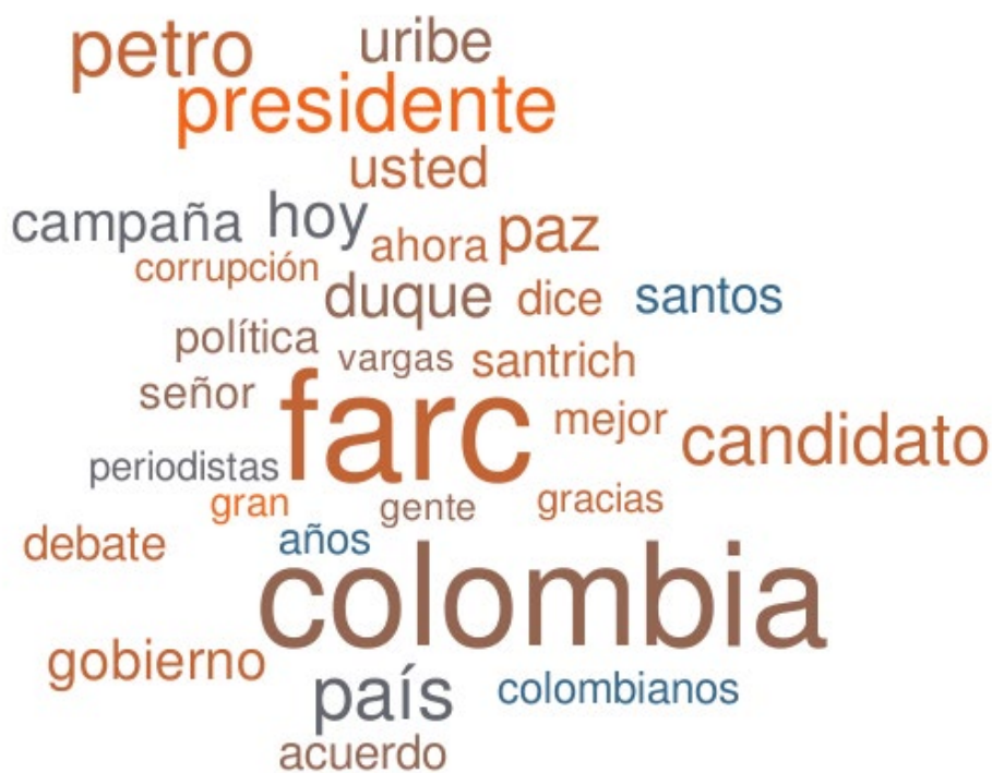
Figure 3. Most used unigrams in Twitter in April.

The size of the unigrams is directly proportional to the number of times that appears in April tweets.